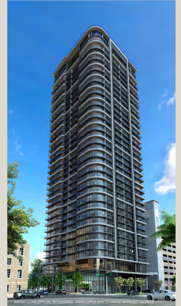
ARTIST CONCEPTUAL RENDERING. DEVELOPER MAY CHANGE WITHOUT NOTICE.