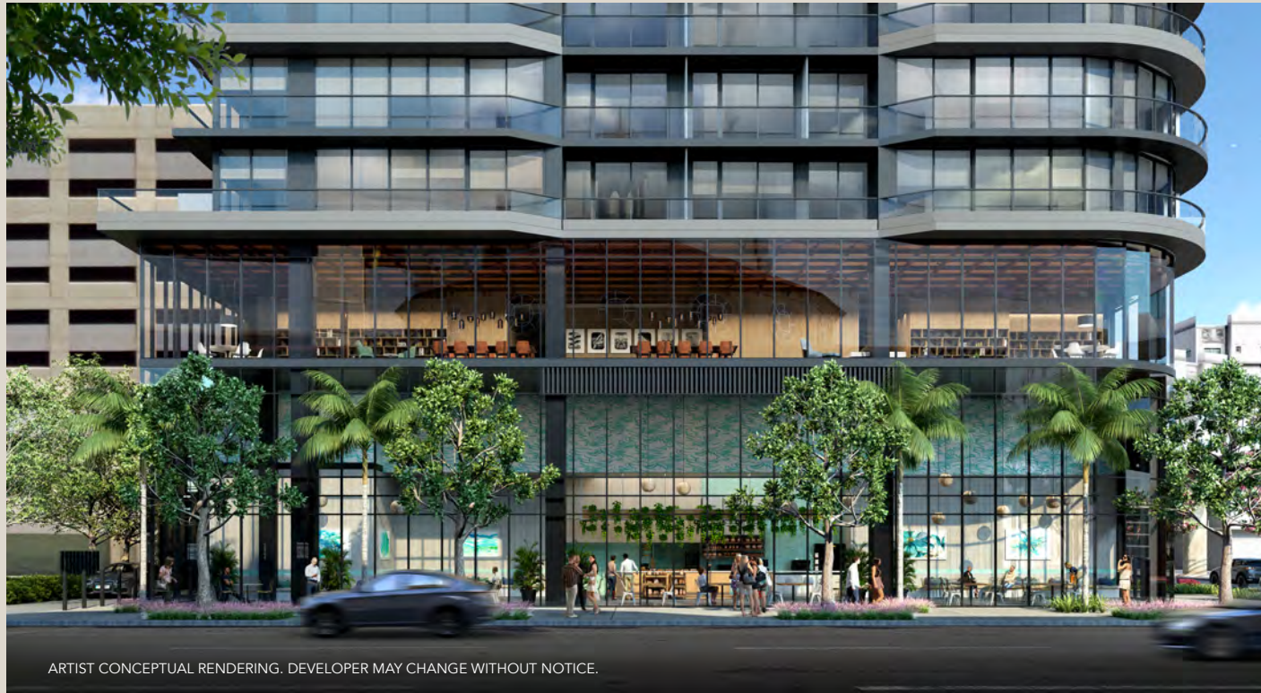
ARTIST CONCEPTUAL RENDERING. DEVELOPER MAY CHANGE WITHOUT NOTICE.